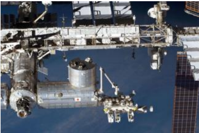
Figure 1: “Kibo” (Japanese Experiment Module, JAXA/NASA)